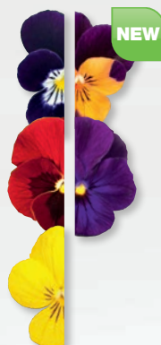
Indian Summer Mix