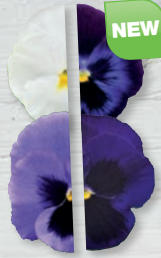
Blue Moon Mix