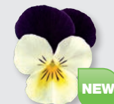
White Purple Wing