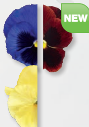
Wine Country Mix