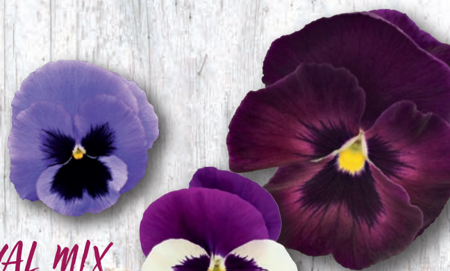
ROYAL MIX Combo