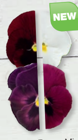
Wine & Roses Mix

THE XX IN INSPIRE DELUXXE® STANDS FOR EXTRA EXTRA LARGE FLOWERS AND PLANTS THAT FILL THE POTS QUICKLY!