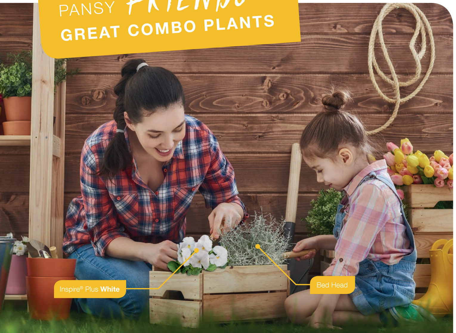
Inspire® Plus White