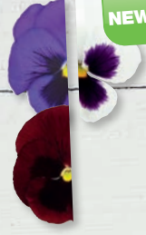
Old Glory Mix