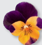
Orange Purple Wing