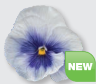
Metallic Blue Blotch