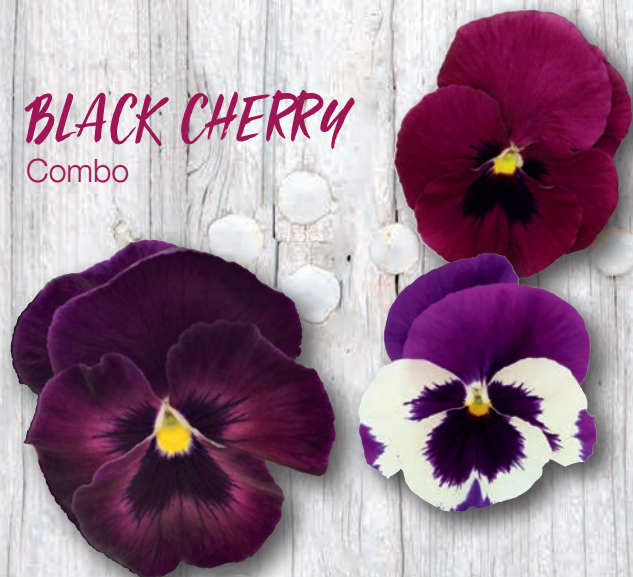
BLACK CHERRY Combo