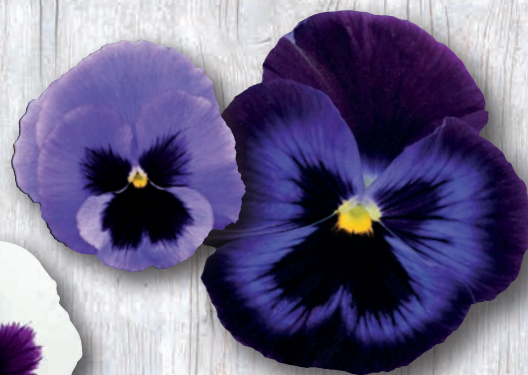
NIGHT SKY Combo