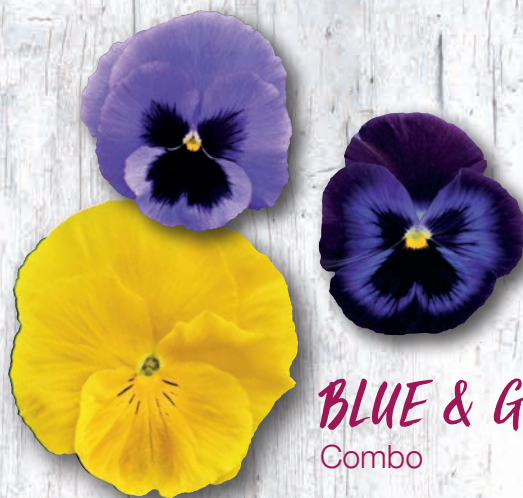
BLUE & GOLD Combo

COLORS AND CULTIVARS THAT LOOK GREAT & PERFORM WELL TOGETHER