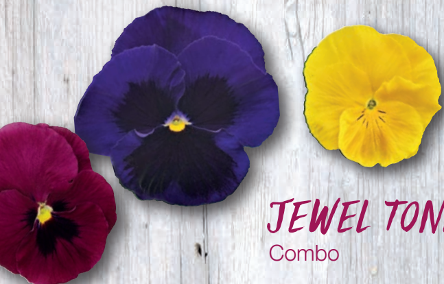
JEWEL TONES Combo