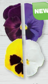
Fall Daze Mix