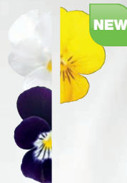
Lemon Tart Mix