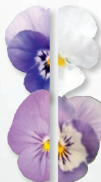
Spring Fling Mix