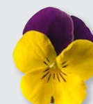
Yellow Purple Wing