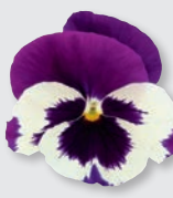
White Violet Wing