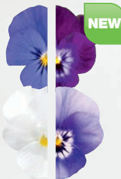
Smooth Sailing Mix