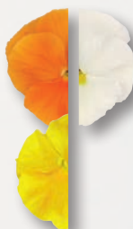
Sunny Day Mix