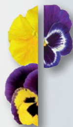
Mardi Gras Mix