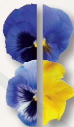
Sun 'n Surf Mix