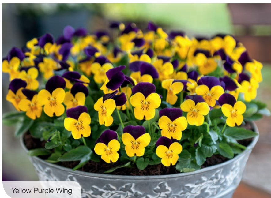
Yellow Purple Wing