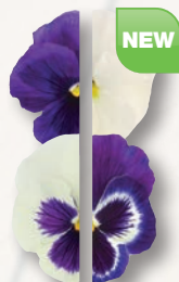
Blueberry Pie Mix