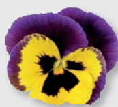
Yellow Purple Wing