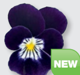
Purple White Face