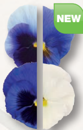
Summer Skies Mix