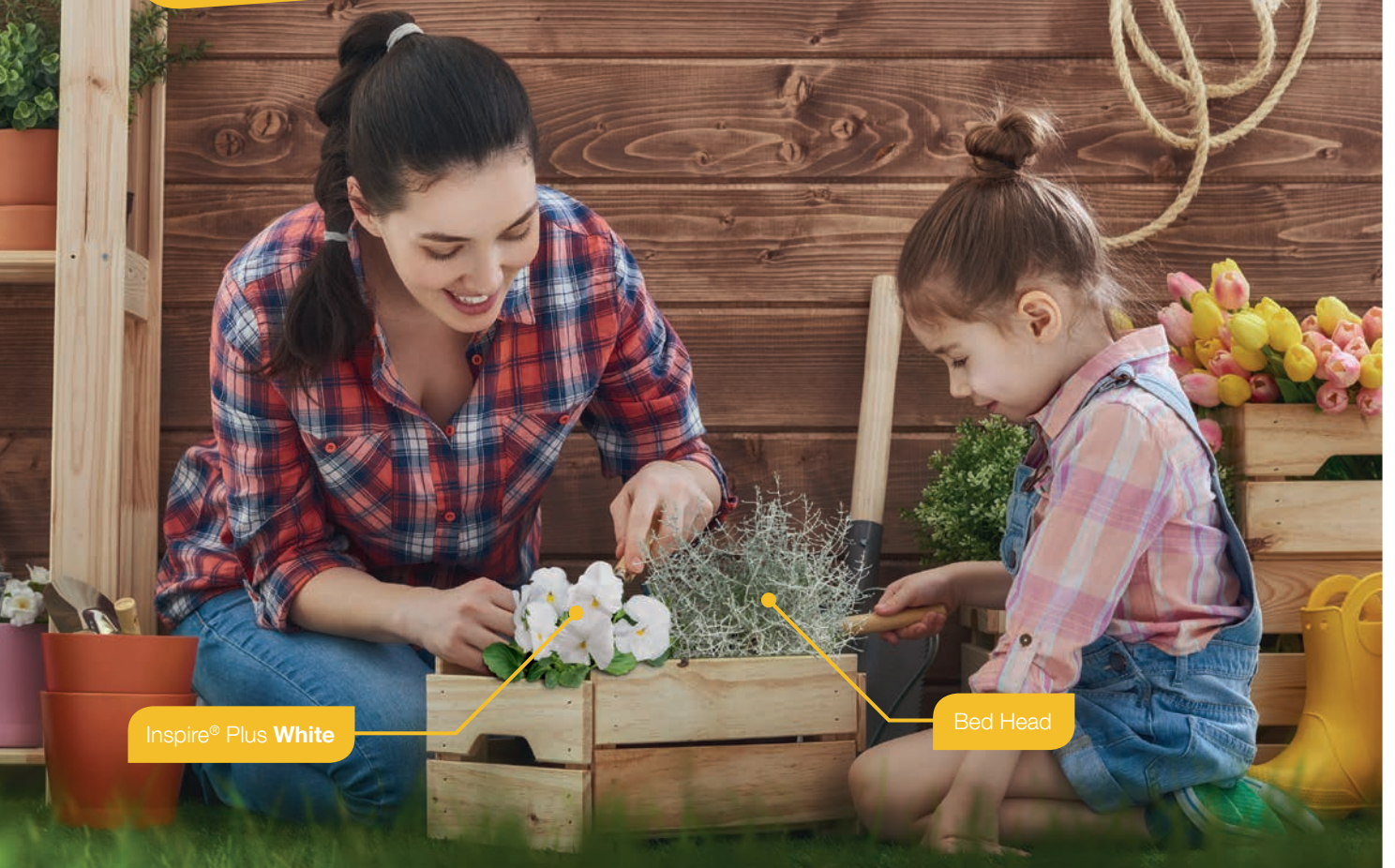
Inspire® Plus White