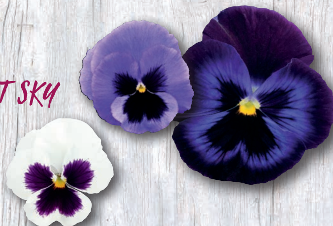
NIGHT SKY Combo