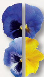
Sun 'n Surf Mix