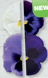
Blue Moon Mix