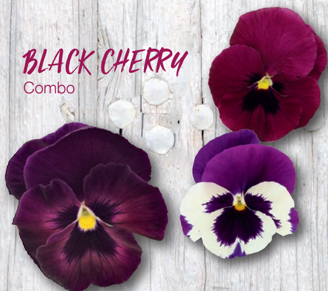
BLACK CHERRY Combo