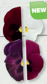
Wine & Roses Mix

THE XX IN INSPIRE® DELUXXE STANDS FOR EXTRA EXTRA LARGE FLOWERS AND PLANTS THAT FILL THE POTS QUICKLY!