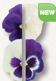
Blueberry Pie Mix