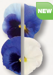
Summer Skies Mix