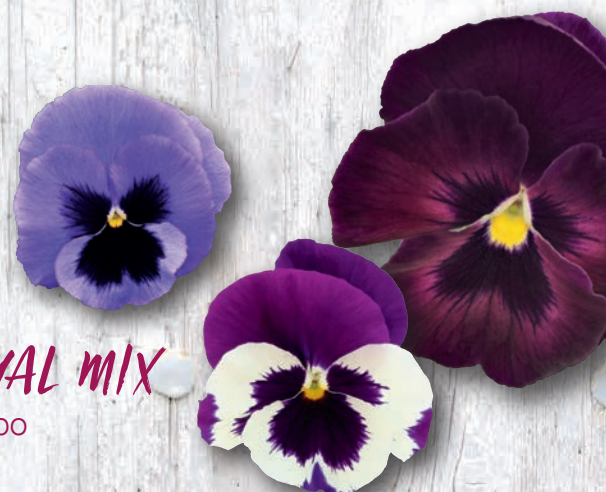
ROYAL MIX Combo