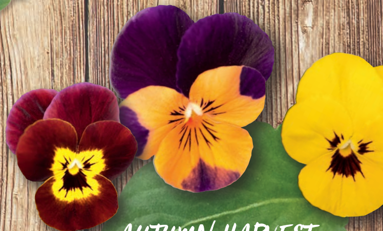
AUTUMN HARVEST Combo