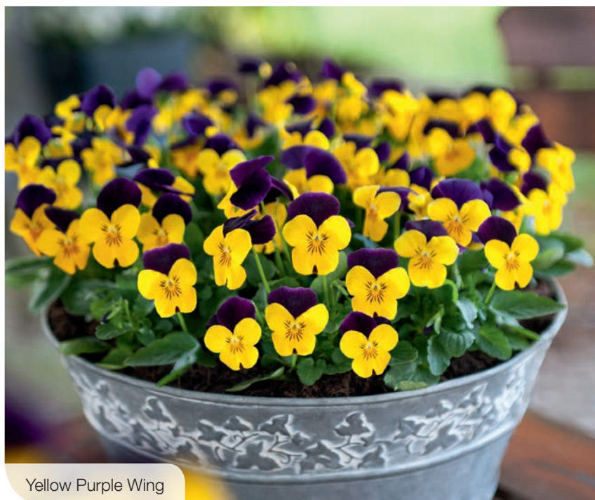
Yellow Purple Wing