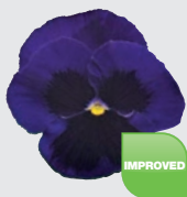
Deep Blue Blotch