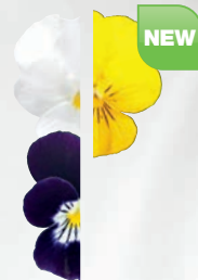
Lemon Tart Mix