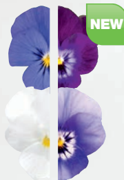
Smooth Sailing Mix