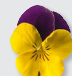
Yellow Purple Wing