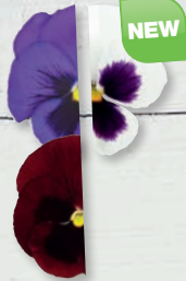
Old Glory Mix