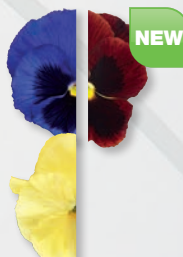
Wine Country Mix