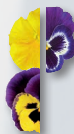
Mardi Gras Mix