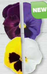
Fall Daze Mix