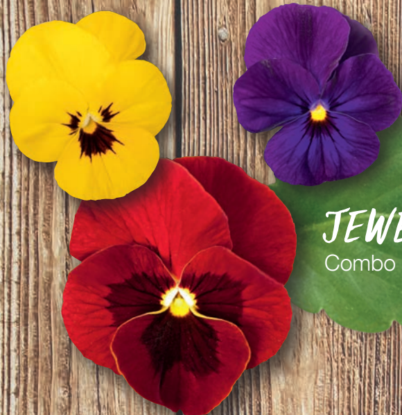
JEWEL TONES Combo

COLOURS AND CULTIVARS THAT LOOK GREAT & PERFORM WELL TOGETHER