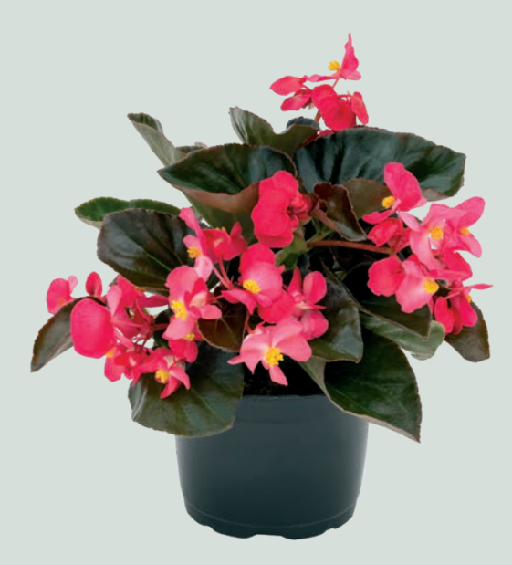
NEW BIG® Deep Rose Bronze Leaf