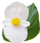
White Green Leaf BB0207P

Begonia x benariensis F 1 BIG ® DeluXXe ®