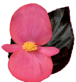
Rose Espresso BB0210P