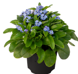
Light Blue MS0404R