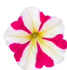
Rose Star PH0208P