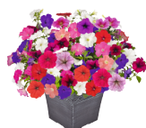
Maxi Mix PH0199P