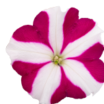
Magenta Star PH0115P