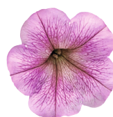
Silver Vein PH0101P