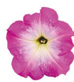
Pink Morn PH0114P