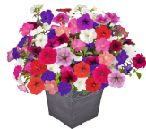
Maxi Mix PH0199P