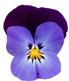
Neon Purple Wing VC0101R/E