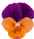
Orange Purple Wing VC0118R/E