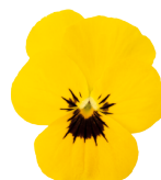
Yellow Blotch VC0116R/E