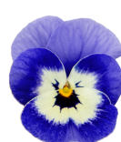
Deep Marina VC0106R/E