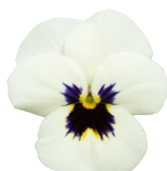
Ivory Blotch VC0133R/E