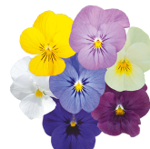
Clear Mix VC0192R/E