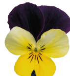
Lemon Purple Wing VC0108R/E