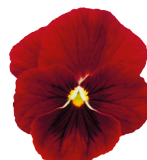
Red Blotch VC0111R/E