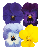
California Mix VC0197E