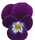
Purple White Face VC0112R/E