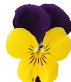
Yellow Purple Wing VC0117R/E