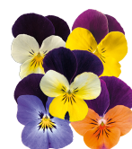
Jump Up Mix VC0195E