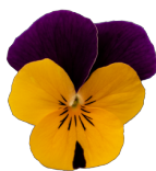
Apricot Purple Wing VC0122R/E