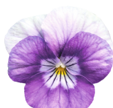
Lavender Pink Face VC0132R/E