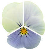
Blue Heaven VC0124R/E