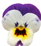
Jolly® Face VC0103R/E