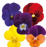
Indian Summer Mix VC0194E