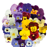
Maxi Mix VC0199R/E