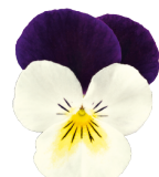
White Purple Wing VC0114R/E