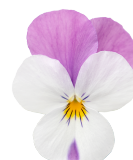
White Pink Wing VC0128R/E