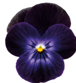
Deep Purple Face VC0105R/E