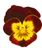
Red Yellow Face VC0121R/E