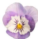
Pink Surprise VC0109R/E