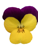
Limoncello Purple Wing VC0131R/E