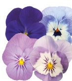
Blackberry Mix VC0198E