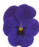
Deep Blue VC0104R/E