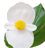
White Green Leaf BB0207P