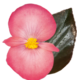
Salmon Bronze Leaf BB0209P