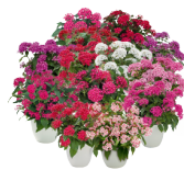
Maxi Mix PL0499P