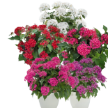
Selected Mix PL0498P