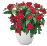
Red Velvet PL0422P