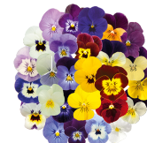
Maxi Mix VC0199R/E