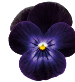
Deep Purple Face VC0105R/E