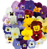
Maxi Mix VC0199R/E