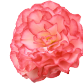
Rose Picotee BT0410P