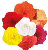
Select Mix BT0496P