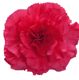
Deep Rose BT0411P