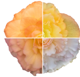
Peach Shades BT0416P