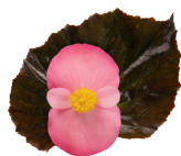
Rose Bronze Leaf