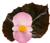
Light Pink Bronze Leaf