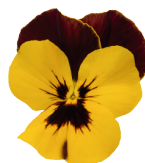
Yellow Red Wing IMPROVED VW0703R/E