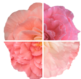
Light Pink Shades BT0513P