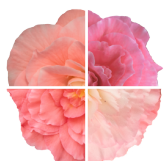
Light Pink Shades BT0513P