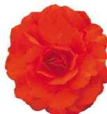
Deep Orange BT0503P