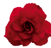
Deep Red BT0505P