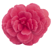
Pink Shades BT0507P