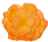
Bright Orange BT0502P