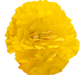
Yellow Red Back BT0405P