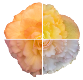
Peach Shades BT0416P