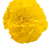
Yellow Red Back BT0405P