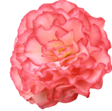
Rose Picotee BT0410P