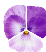
Marina Lavender VW0226R/E