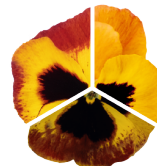
Fire Surprise VW0223R/E