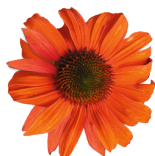
Orange Red EP2103T