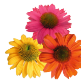
Golden Summer Mix EP2198T