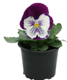
Purple & White VW0405R/E