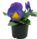
Blue & Yellow VW0404R/E