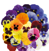
Maxi Mix VW0299R/E