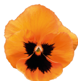
Orange Blotch VW0213R/E