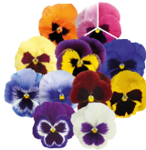
Blotch Mix VW0288R/E