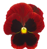
Red Blotch VW0215R/E