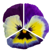
Blueberry Lemon VW0228R/E