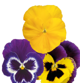
Mardi Gras Mix VW0296E