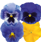
Sun'n Surf Mix VW0298E