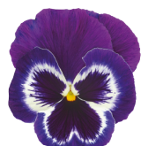
Violet Face VW0216R/E