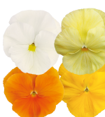
Sunny Day Mix VW0297E