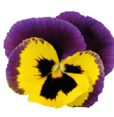
Yellow Purple Wing VW0211R/E