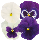
Blueberry Pie Mix VW0293E