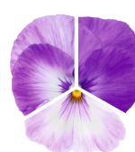
Marina Lavender VW0226R/E