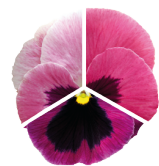
Pink Shades VW0220R/E