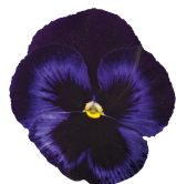
Blue Velvet VW0203R/E