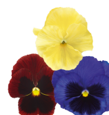
Wine Country Mix VW0291E