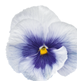
Metallic Blue Blotch VW0219R/E