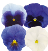
Summer Skies Mix VW0292E