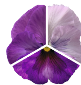
Lavender Blotch Shades VW0205R/E