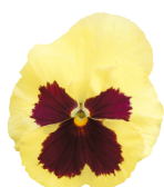
Lemon Blotch VW0204R/E