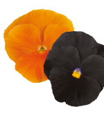
Jack-o-Lantern Mix VW0290E