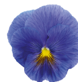
True Blue VW0210R/E