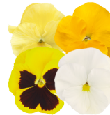
Limoncello Mix VW0294E