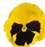
Yellow Blotch VW0207R/E