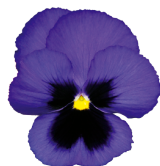
Blue Blotch VW0202R/E