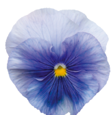
Light Blue VW0218R/E