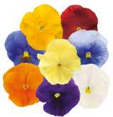
Clear Mix VW0289R/E