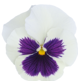
White Blotch VW0217R/E