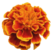
Orange Flame TP0309C/D