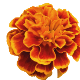
Orange Flame TP0309C/D