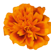
Orange Bee TP0305C/D