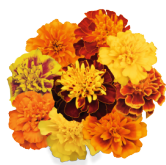
Maxi Mix TP0399C/D