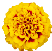
Yellow Bee TP0301C/D