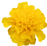
Deep Yellow TP0311C/D