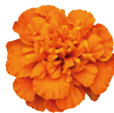
Deep Orange TP0308C/D