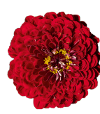
Deep Red ZE0407R