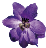
Black Knight DH0101R