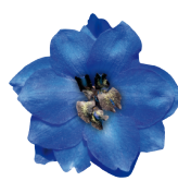
Blue Jay DH0107R