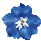
Blue Bird DH0106R