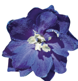
King Arthur DH0104R