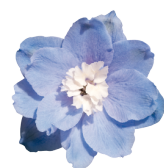
Summer Skies DH0103R