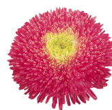
Bright Rose CC0306R