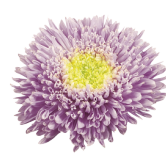
Light Blue CC0303R