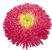
Bright Rose CC0306R