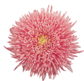
Salmon Rose CC0305R