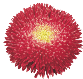
Bright Red CC0307R