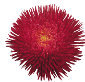
Deep Red CC0309R