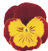
Red & Gold VW6007R