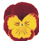
Red & Gold VW6007R