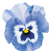
Light Blue VW6003R