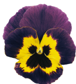
Violet & Gold VW6008R