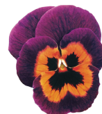
Poker Face VW6004R