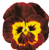
Mahogany & Gold VW6001R