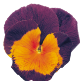
Jolly® Joker VW6005R