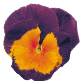
Jolly® Joker VW6005R