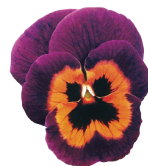
Poker Face VW6004R