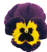
Violet & Gold VW6008R