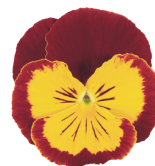
Red & Gold VW6007R