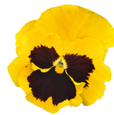
Yellow Blotch VW0613R/E