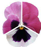
Pink Surprise Blotch VW0606R/E