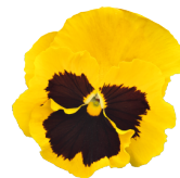
Yellow Blotch VW0613R/E