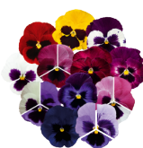
Blotch Mix VW0698R/E