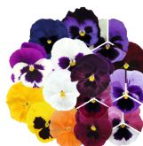
Maxi Mix VW0699R/E