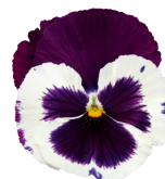
White Violet Wing VW0609R/E