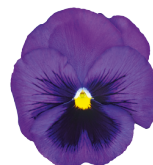
Blue Surprise VW0601R/E