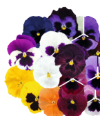
Maxi Mix VW0699R/E