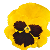
Yellow Blotch VW0613R/E