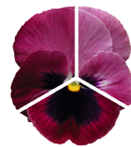
Light Rose Blotch VW0614R/E