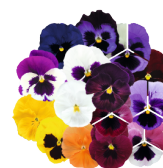
Maxi Mix VW0699R/E