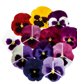
Blotch Mix VW0698R/E