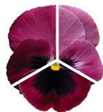
Light Rose Blotch VW0614R/E