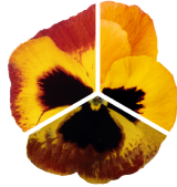
Fire Surprise VW0223R/E