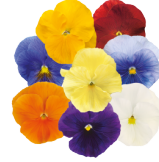
Clear Mix VW0289R/E