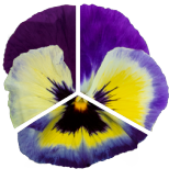
Blueberry Lemon VW0228R/E