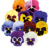
Blotch Mix VW0288R/E