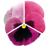
Pink Shades VW0220R/E