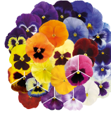
Maxi Mix VW0299R/E