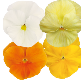
Sunny Day Mix VW0297E