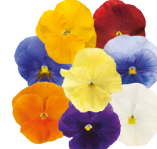
Clear Mix VW0289R/E