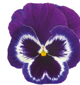
Violet Face VW0216R/E