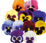
Blotch Mix VW0288R/E