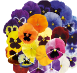
Maxi Mix VW0299R/E