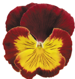
Red & Gold VW0303R