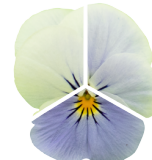
Blue Heaven VC0124R/E