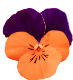
Orange Purple Wing IMP VC0118R/E