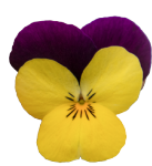
Limoncello Purple Wing VC0131R/E