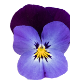
Neon Purple Wing VC0101R/E