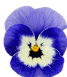
Deep Marina VC0106R/E