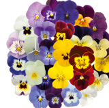
Maxi Mix VC0199R/E