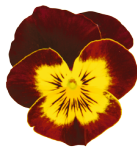
Red Yellow Face VC0121R/E