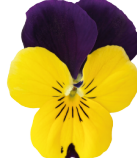
Yellow Purple Wing VC0117R/E