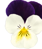
White Purple Wing VC0114R/E