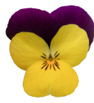
Limoncello Purple Wing VC0131R/E