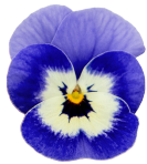
Deep Marina VC0106R/E