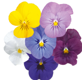
Clear Mix VC0192R/E