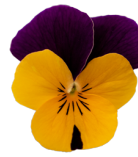
Apricot Purple Wing VC0122R/E