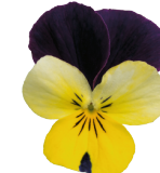
Lemon Purple Wing VC0108R/E