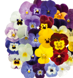
Maxi Mix VC0199R/E