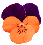
Orange Purple Wing IMP VC0118R/E