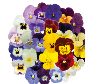
Maxi Mix VC0199R/E